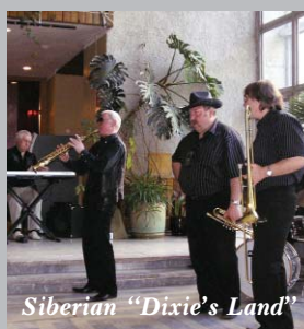
Siberian “Dixie’s Land”