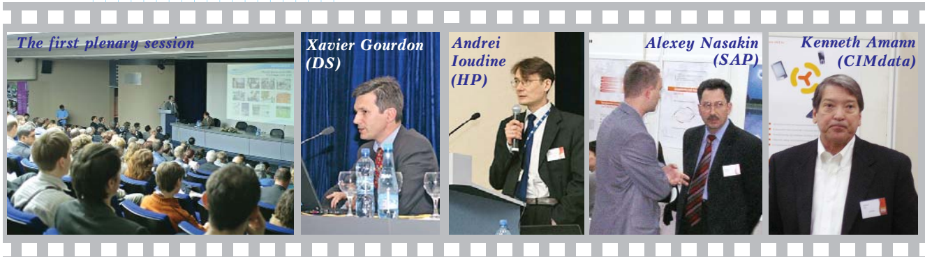
The first plenary session

As it was rightly mentioned in the KOMPAS press-release (not to be confused with the ASKON product of the same name), the forum was truly international: its