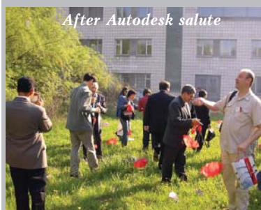
After Autodesk salute

A few words about the organizers: the LEDAS Group is well known to our readers as developers of PLM software components. Their products have been described in a number of articles. Since isicad-2004 , however, LEDAS activity has gone beyond the scope of software development and it now embraces consulting, training, supplying commercial CAD, and the like. Currently the company positions itself as a regional Competence Center and makes every effort to maintain its reputation. Therefore, organizing such